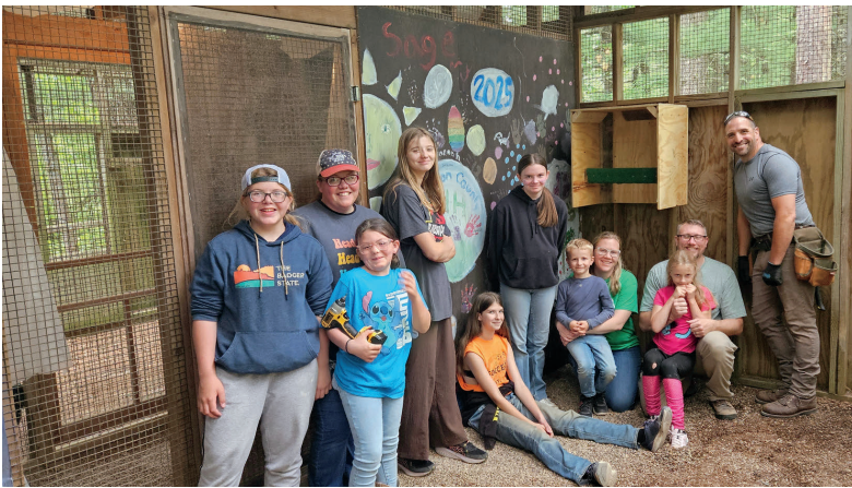
Woodworking project youth and adult volunteers headed to Upham Woods for a day of renovation! The camp is finally getting a new raptor after 5 years, and the cage had to be rebuilt!