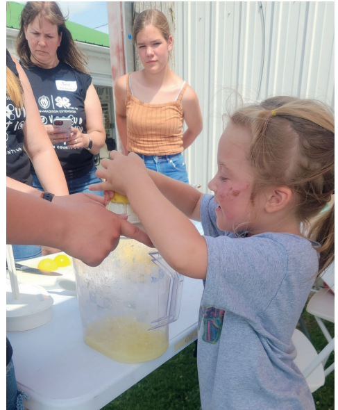
Over 60 Cloverbuds had an amazing, yet hot day at Cloverbud Discovery Day. Youth got the chance to learn in three different sessions of their choice. Sessions included foods, STEM, arts and crafts, cattle, and more!