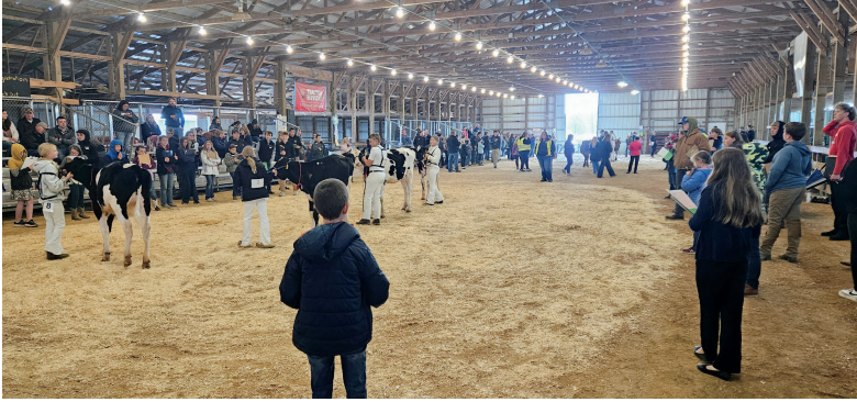
Our dairy judging team participated in the annual AASD competition, and several youth made it to state!