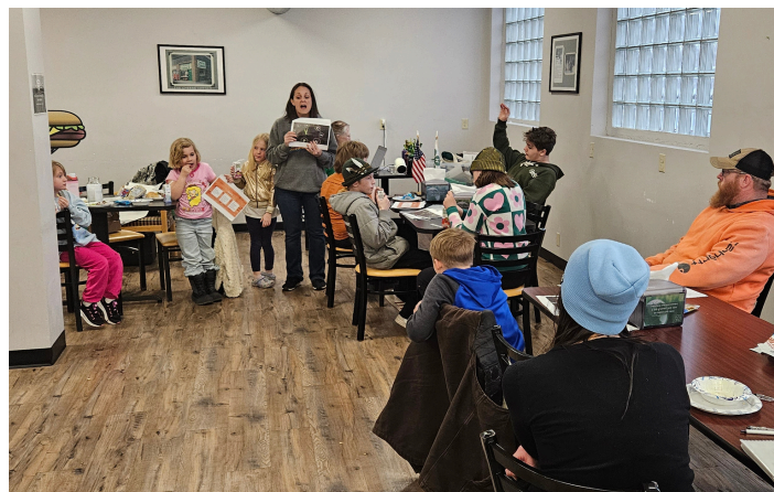
The ViroquaTeers Club learned about healthy foods, why they're important to eat, and how to help them grow.

While it is important to teach decision-making skills, allowing youth to choose also creates belonging and buy-in. While it may be more time-consuming, not engaging youth leads to a disconnect, disappointment, and not wanting to come back due to a negative experience. Embracing a youth-led approach cultivates confident, capable individuals who feel valued and invested, ultimately enriching your family and community in ways you might never have imagined.