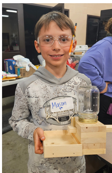
Over 20 youth of all ages participated in our woodworking workshop. They could make wooden animals, tension tables, or candy dispensers.