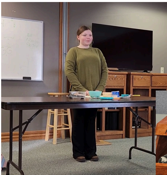
Arts Fest never ceases to amaze me! Our youth are truly talented! Demonstrations, instrument and vocal performances, art, photography, dance and more! Well done and congratulations!