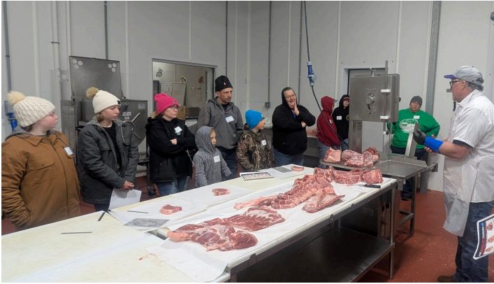
Youth attendees learned how to break down a pig, label cuts, and how processing works.