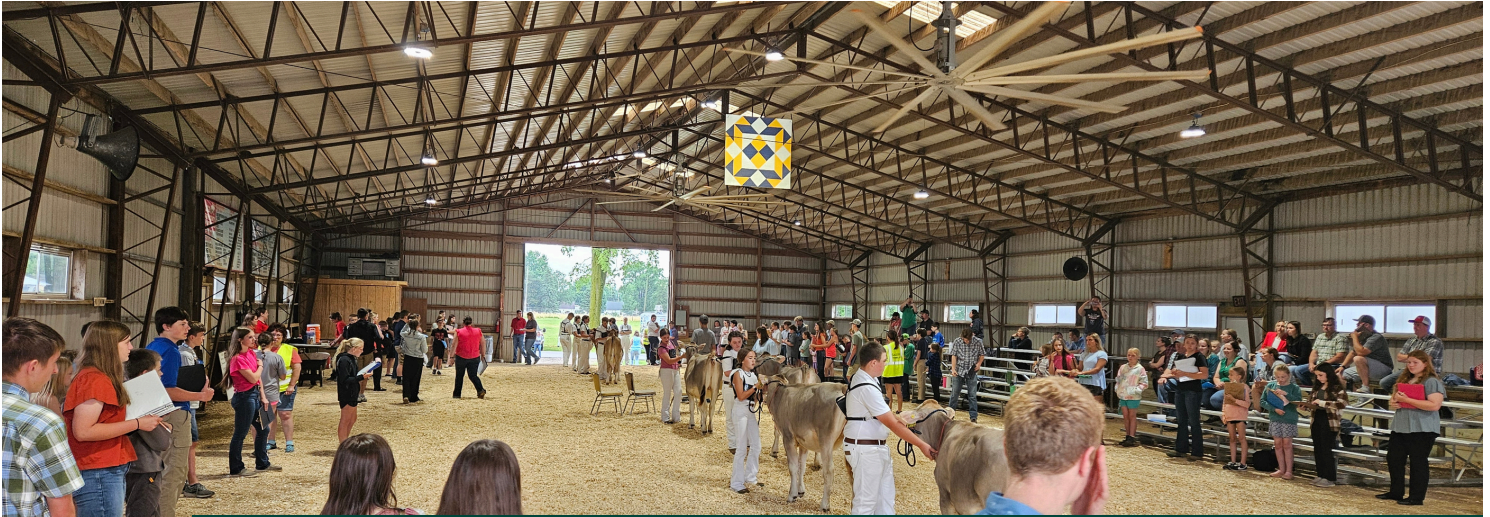
YOUTH PARTICIPATE IN JUDGING DAIRY CATTLE AT AREA ANIMAL SCIENCE DAYS. TEAMS FROM AROUND THE STATE COMPETED, VERNON COUNTY JR TEAM PLACED 6TH

UW-MADISON DIVISION OF EXTENSION VERNON COUNTY STAFF