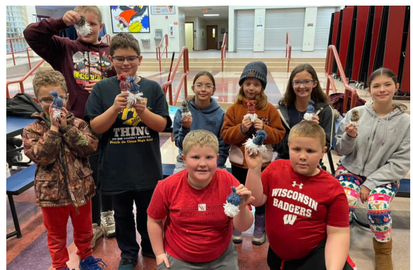
THE DAVIS DIGGERS DISPLAYING THEIR GNOME PROJECTS