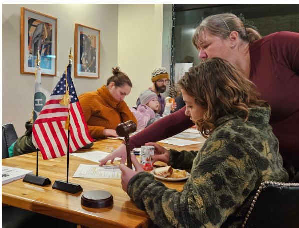
THE RETREAT RAMBLERS AND LIBRARY LENDERS HAVE COMBINED INTO A NEW CLUB, CALLED THE VIROQUATEERS! THEY'RE MEETING AT THE NOBLE RIND IN DOWNTOWN VIROQUA--WE'RE SO EXCITED FOR THIS NEW CLUB!