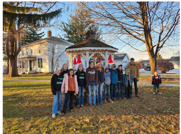
MANY CLUBS GOT TOGETHER TO DECORATE THE BUTT HOUSE FOR CHRISTMAS. HERE ARE TWO PHOTOS FROM THE LIBERTY POLE BOOSTERS