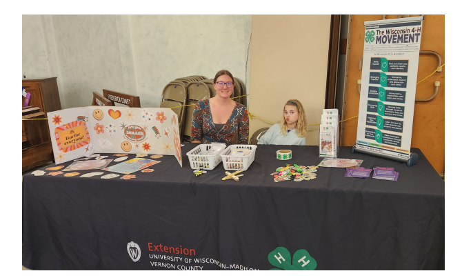
THANKFRUL FOR THE FAMILIES THAT SIGNED UP TO VOLUNTEER EITHER AT THE FOOD STAND OR SHARING 4-H WITH PASSERBY AT THE FAIR