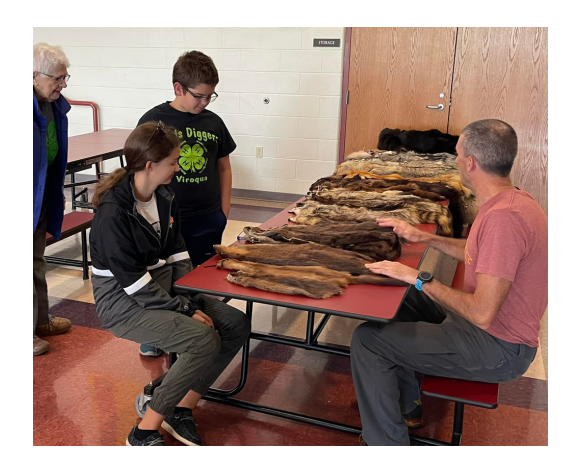
DAVIS DIGGERS MEMBERS LEARN ABOUT DIFFERENT TYPES OF FUR AT A CLUB MEETING