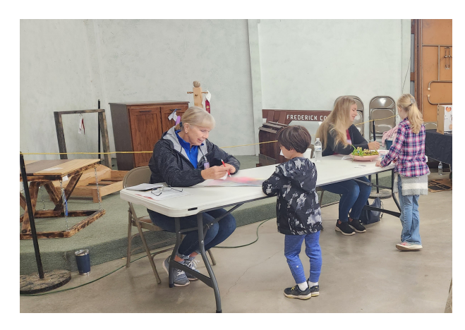
CLOVERBUDS HAD THE OPPORTUNITY TO TALK WITH JUDGES DURING THE FAIR ABOUT THEIR PROJECT ENTRIES.