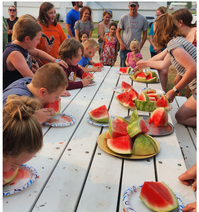
YOUTH HAD A FANTASTIC TIME COMPETING AT OUR FIRST EVER CLUB WATERMELON EATING CONTEST. THIS GREATNESS WAS PLANNED BY OUR VERY OWN YOUTH LEADERSHIP PROJECT'S MAGGIE B FROM MISSISSIPPI STEAMERS