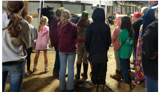
DAIRY YOUTH GATHER AT THEIR ANNUAL DAY OF DAIRY TO SPEND TIME WITH FRIENDS, LEARN SHOW TIPS AND TRICKS, AND SO MUCH MORE