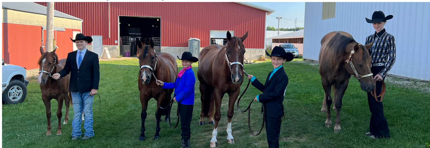
VERNON COUNTY HORSE PROJECT MEMBERS COMPETED AT THE WISCONSIN 4-H COUNTY CLASSIC HORSE SHOW IN WEST SALEM, WI