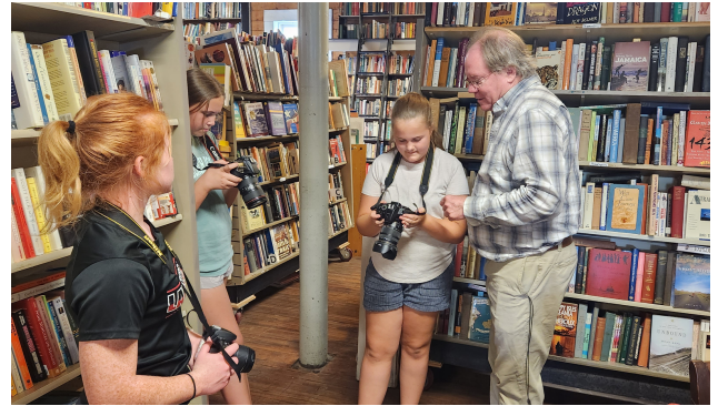
PHOTOGRAPHY PROJECT MEMBERS WORKED ON TELLING STORIES THROUGH PHOTOS WITH OUR NEW PHOTOGRAPHY VOLUNTEER. THEY VISITED SEVERAL SHOPS IN VIROQUA TO PHOTOGRAPH IN VARIOUS SETTINGS