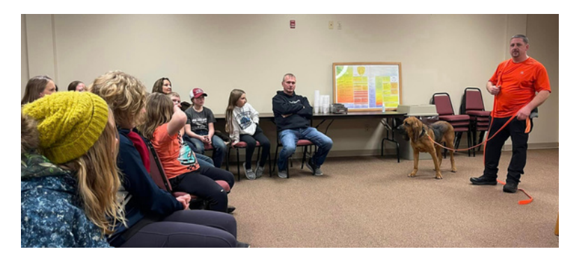
DOG PROJECT MEMBERS AND GENERAL 4-H MEMBERSHIP WERE INVITED TO AN INFORMATIONAL DEMONSTRATION WITH POLICE AND SHERRIF K-9 OFFERS TO LEARN ABOUT HOW THEY USE DOGS IN A VARITEY OF WAYS.