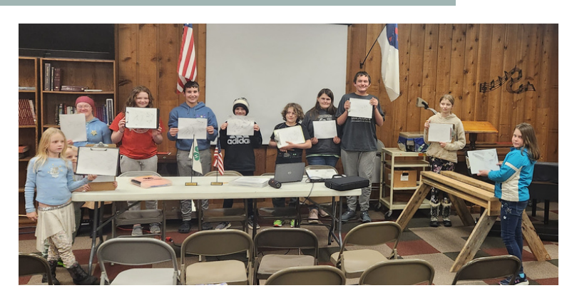
4-H CLUB MEMBERS POSE WITH THEIR VELOCIRAPTER DRAWINGS AFTER A DEMONSTRATION PRESENTATION. WE ARE VERY EXCITED TO HEAR ABOUT ALL OF THE WONDERFUL CLUB DEMONSTRATIONS HAPPENING THROUGHOUT THE COUNTY CLUBS!