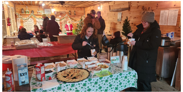
THIS YEAR'S LIGHT THE DRIVE WAS SPECTACULAR! OUR CLUBS' DISPLAYS GET BETTER AND BETTER. WE WERE THANKFUL FOR A WARM PLACE TO COME INSIDE AND ENJOY SOME HOT CHOCOLATE AND COOKIES