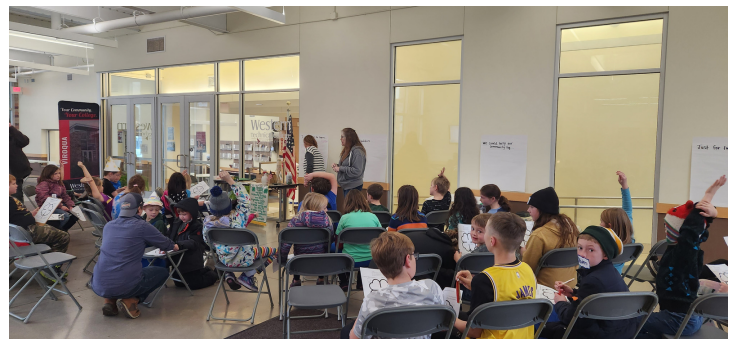
THE LIBRARY LENDERS 4-H CLUB HELD THEIR FIRST MEETING IN DECEMBER, THEY LEARNED THE PLEDGE AND HOW IT GUIDES 4-H