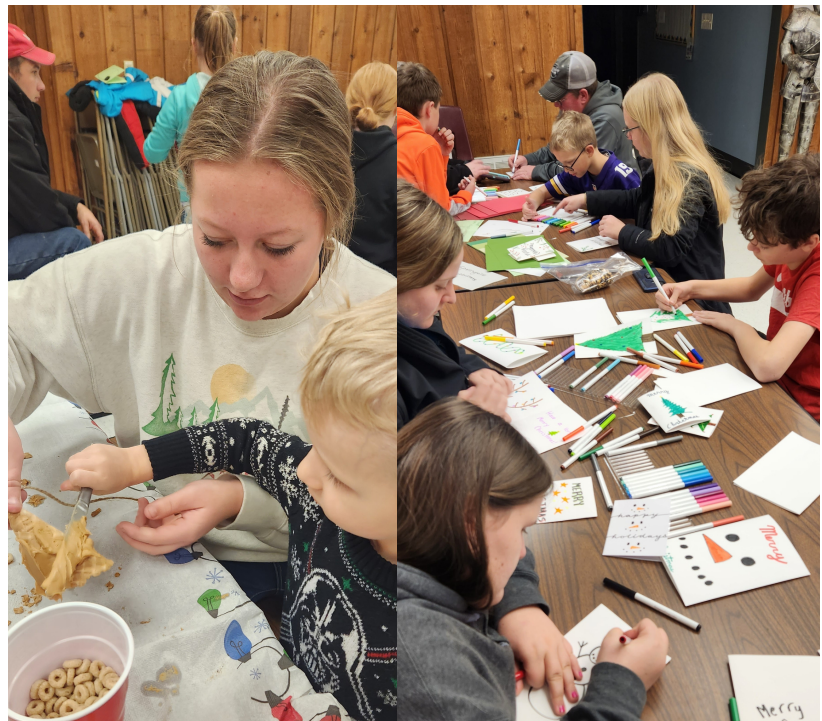
MANY OF OUR 4-H CLUBS HOSTED CHRISTMAS PARTIES IN DECEMBER. SPRINGVILLE SUPERSTARS MADE GRINCH HEARTS, PEANUT BUTTER BIRD FEEDERS, AND CARDS FOR NURSING HOMES