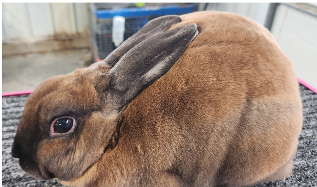
SEVERAL VERNON COUNTY YOUTH PARTICIPATED IN AN ESSAY CONTEST TO BE AWARDED A MINI REX RABBITS, DONATED BY A LOCAL FAMILY! CONRATS TO IVORY AND LINCOLN