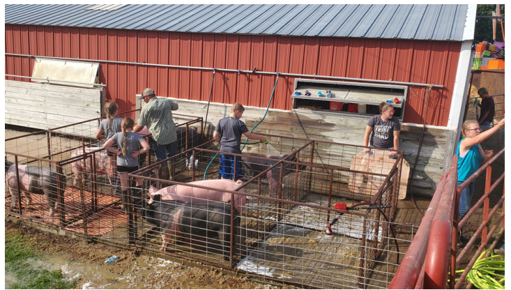
THANKFUL FOR SUPPORTIVE, INVOLVED ADULTS!