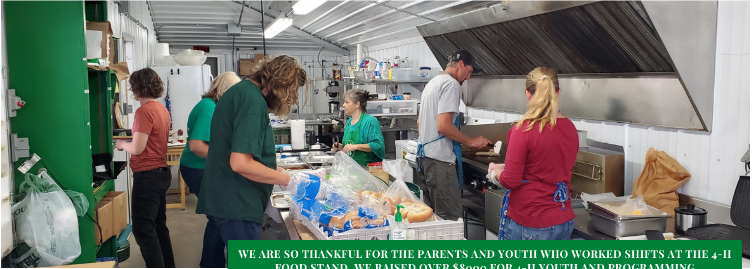
WE ARE SO THANKFUL FOR THE PARENTS AND YOUTH WHO WORKED SHIFTS AT THE 4-H FOOD STAND, WE RAISED OVER $8000 FOR 4-H YOUTH AND PROGRAMMING