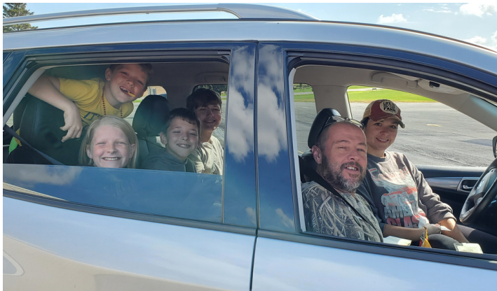
FAMILIES COMPETED IN OUR 2ND ANNUAL ROAD RALLYE SCAVENGER HUNT, NO ONE GOT TOO LOST!