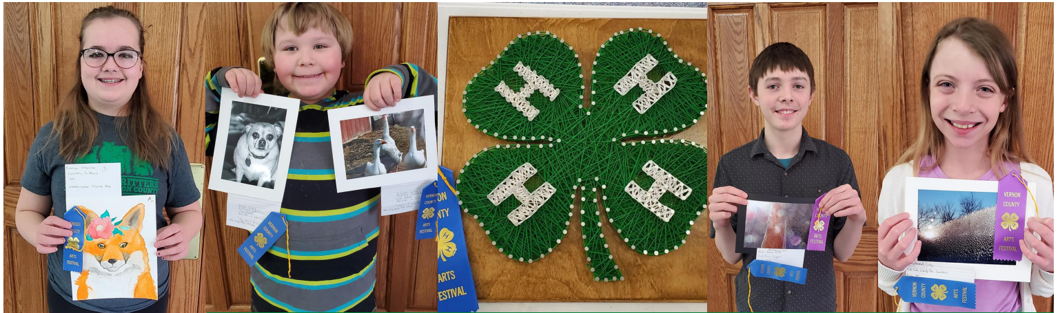
YOUTH PHOTOGRAPHY AND ART WINNERS FROM OUR ANNUAL ARTS FEST IN MARCH. ARTS FEST CONSISTS OF AN ARTS & CRAFTS, PHOTOGRAPHY, SPEAKING/PERFORMANCE, MUSICAL/VOCAL/INSTRUMENTAL PERFORMANCE, AND CLOTHING REVUE COMPETITION