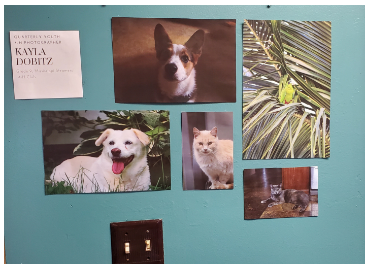
THIS QUARTER, THE 4-H OFFICE IS BOASTING THE FANTASTIC PHOTOGRAPHY WORK OF KAYLA DOBITZ AS THE FEATURED 4-H QUARTERLY ARTIST/PHOTOGRAPHER PROGRAM