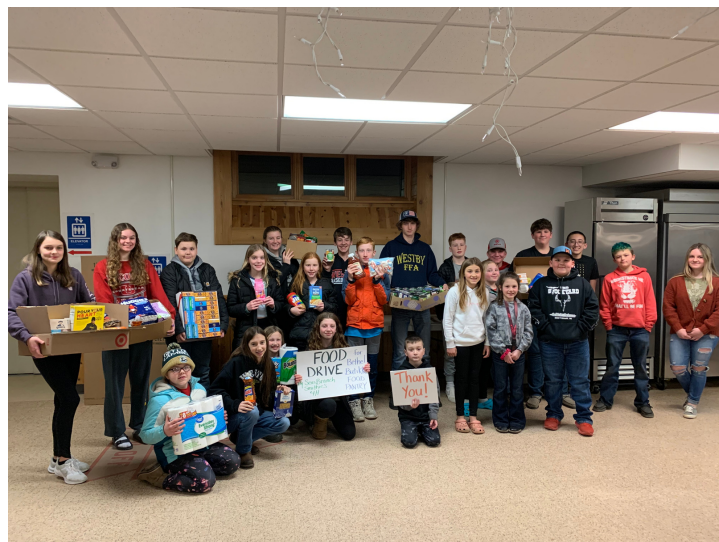
RIVERSIDE BADGERS WORKED TOGETHER TO DONATE FOOD IN THE LAST YOUTH LEADERSHIP CHALLENGE