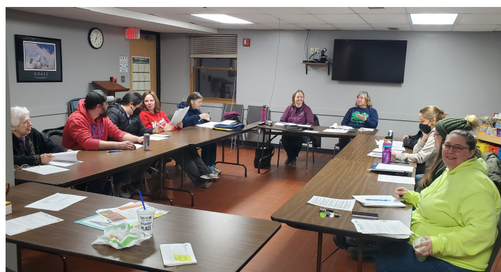
ADULT LEADERS MET FOR THEIR MONTHLY FEDERATION MEETING WHERE COUNTY WIDE DECISIONS ARE MADE