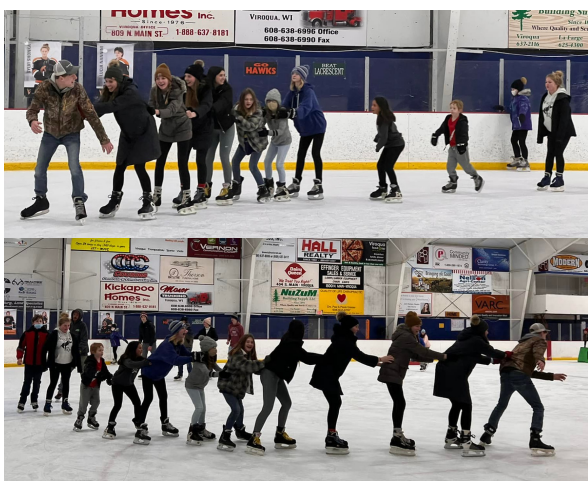
ABOVE: RIVERSIDE BADGERS ENJOYED AN ICE SKATING ACTIVITY TOGETHER