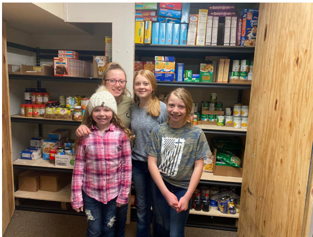
LIBERTY POLE BOOSTER CLUB YOUTH EARNING POINTS FOR THE YOUTH LEADERSHIP CHALLENGE BY VOLUNTEERING AT A LOCAL FOOD PANTRY!