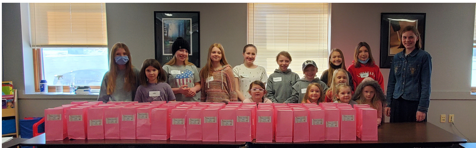
YOUTH SPENT THE MORNING MAKING NO-BAKE COOKIES, DECORATING CUPCAKES, AND LEARNING ABOUT BAKED GOODS FAIR ENTRIES. CUPCAKES AND COOKIES WERE THEN PACKED AND DELIVERED TO RESIDENTS AT VERNON MANOR FOR VALENTINE'S DAY