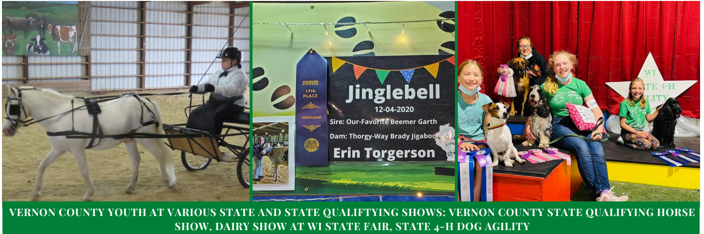
VERNON COUNTY YOUTH AT VARIOUS STATE AND STATE QUALIFYING SHOWS: VERNON COUNTY STATE QUALIFYING HORSE SHOW, DAIRY SHOW AT WI STATE FAIR, STATE 4-H DOG AGILITY