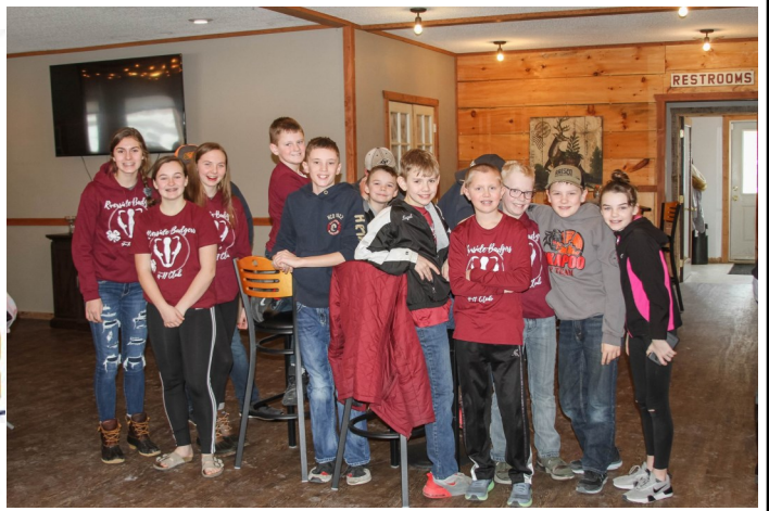
Above: Members of Banquet Hosts, Riverside Badgers 4-H