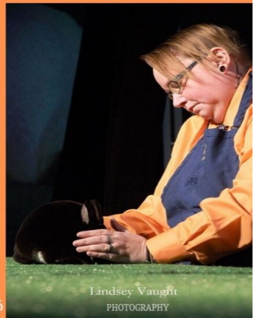
Lindsey Vaught PHOTOGRAPHY

Sign up by calling the Extension Office: 608-637-5276