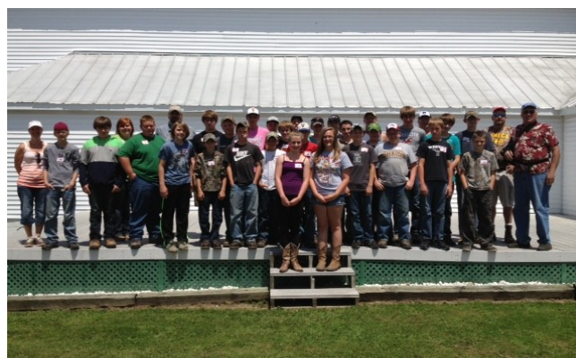
Congratulations to the 2013 Vernon County Tractor & Machinery Certification Class! Thank you to all of our instructors, sponsors and volunteers who support this program!